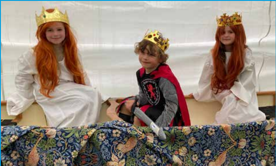
Children at the Shelsleys Pre-Raphaelite Festival

Clifton-upon-Teme • The Shelsleys • Lower Sapey