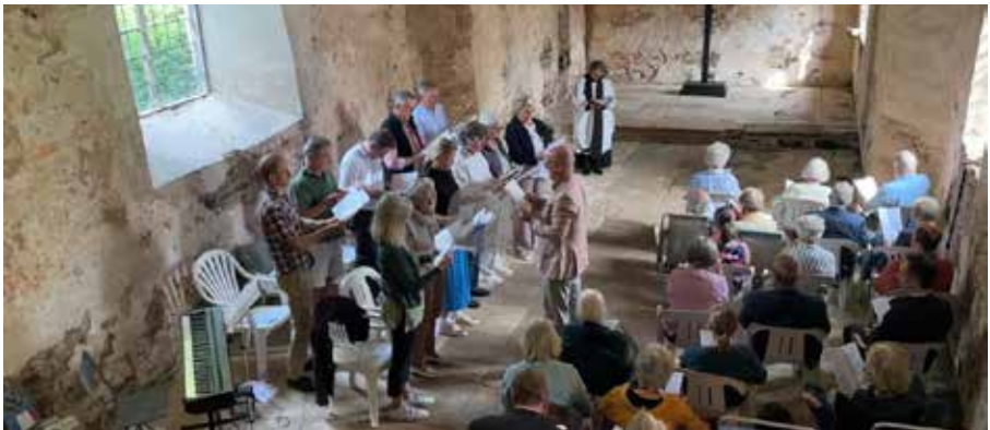
Evensong with the Bach Choir at Old St Bartholomew's Church, Lower Sapey (See report on page 12)