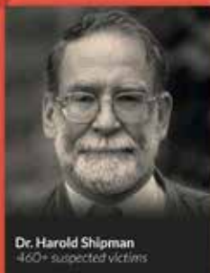
Dr. Harold Shipman 460+ suspected victims

Potentially the two biggest serial killers in history ... you might not have suspected.