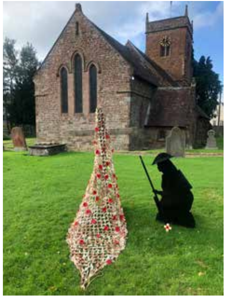
Beautiful All Saint's – We will remember them.