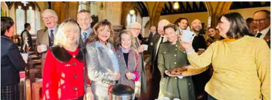
Shelsley Parishioners enjoying refreshments together after the service.