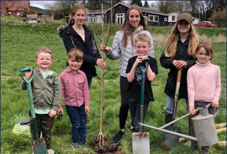
Planting the 7 Platinum Jubilee Trees in The Shelsley's

Clifton upon Teme • The Shelsleys • Lower Sapey